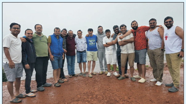
Club stag trip to Kaas Plateau's Kaaswara Resort, Satara