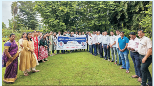
Members attended Tree Plantation