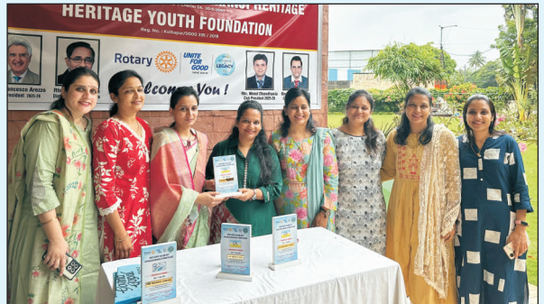
Chartered Accountant's Felicitation on CA Day