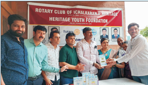
Farmer's Felicitation on Agriculture Day