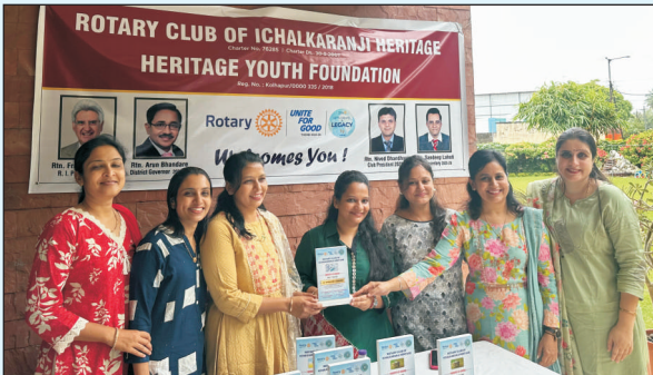
Doctor's Felicitation on Doctor's Day