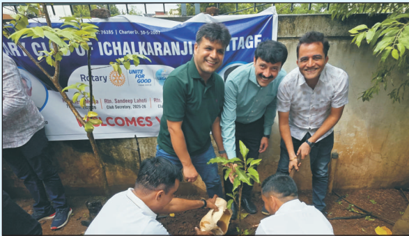
Rotary Year begins with Tree Plantation