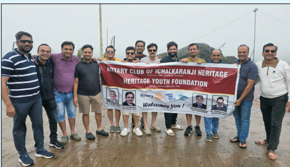
Members having fun near Kaas Lake, Satara